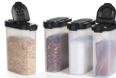
Large Spice Shakers Includes four 1-cup/250 mL shakers. 81686 $24 $19