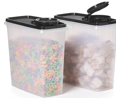
2 FOR $30 Cereal Storers Set of two. 13 cup/3.1 L. 81687 $44 $30