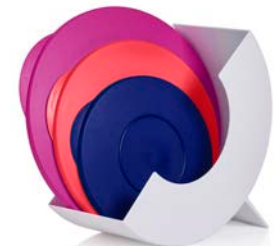
The Place For Seals Keep seals in order. Fits neatly in cabinet or on countertop. 81684 $25 $16

For discreet storage, mount on wall or inside cabinet.