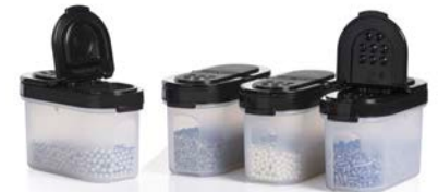
Small Spice Shakers Includes four 1/2-cup/125 mL shakers. 81685 $18 $13