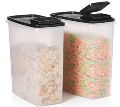
2 FOR $35 Super Cereal Storers Set of two. 20 cup/4.8 L. 81688 $50 $35